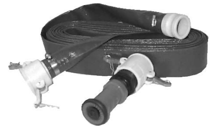
ADJUSTABLE FIRE NOZZLE & HOSE (Optional)