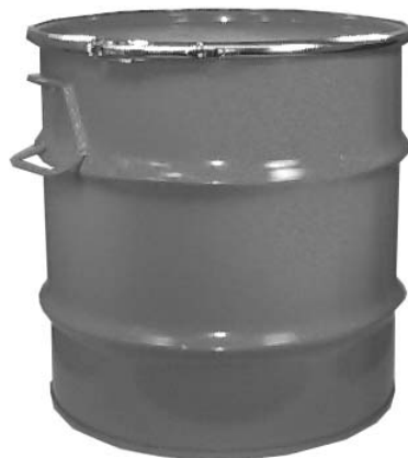
ALUMINUM CONTAINER (Optional)